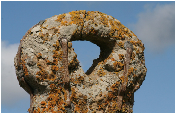
The Embo Cross - Marking the site of the battle

According to Sir Robert Gordon's account, the