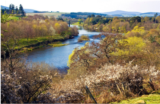
The River Dee at Drumoak

The origins of the feud can be traced back to a history of hostility and acts of violence committed by both clans against each other. The tensions